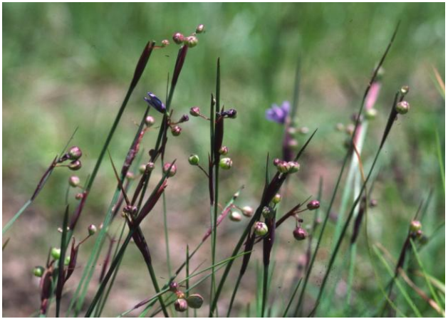
Slender Blue-eyed Grass showing the narrowly winged, purplish scape. In the lower photo, the scape clearly extends beyond the flower buds.

A Species of Greatest Conservation Need in the Massachusetts State Wildlife Action Plan