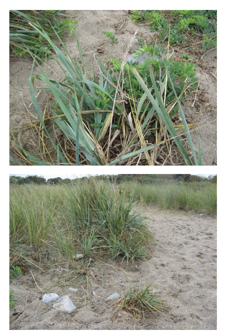
Sea Lyme-grass in its sandy dune habitat. The adjacent trail shows the danger from trampling.

State Status: Endangered Federal Status: None