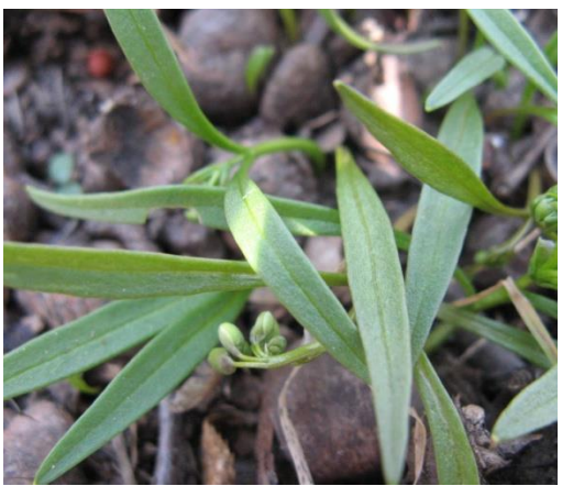
Narrow-leaved Spring-beauty.

AIDS TO IDENTIFICATION: The leaves of Narrow-leaved Spring-beauty are generally much longer than wide, 6 to 20 cm (2–8 in.) by 2 to 5 mm. Below the lowest pedicel of the flower cluster is a firm herbaceous bract, 2 to 10 mm long and 2 to 6 mm wide. Narrow-leaved Spring-beauty flowers and fruits in early spring; by summer, the above-ground parts of the plant disappear.