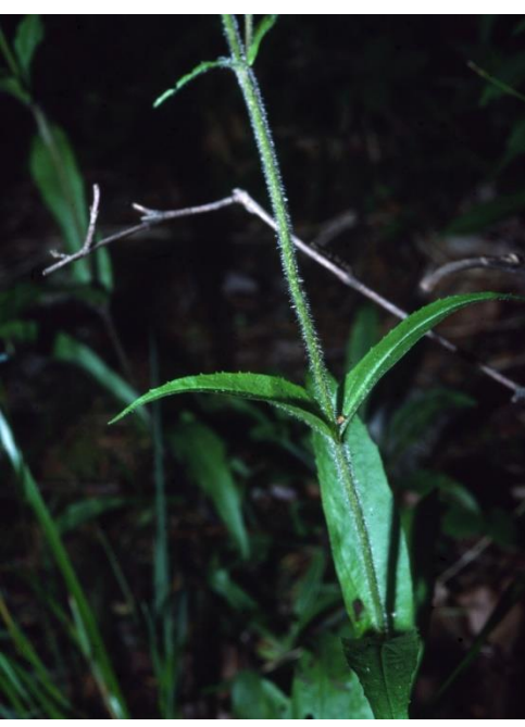
Top: Hairy Beard-tongue's light purple flowers. Bottom: Stem with opposite, stalkless leaves and hairy stem.

A Species of Greatest Conservation Need in the Massachusetts State Wildlife Action Plan