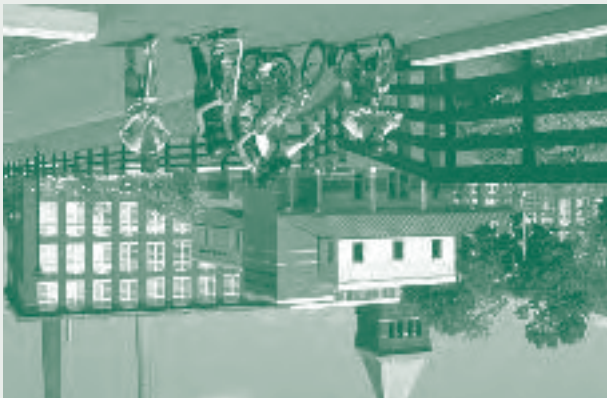
Above: The trail offers outstanding views of the Hoosac Mountain Range.

Ayer – Dunstable, 11 miles Nashua River Rail Trail, Dennis – Wellfleet, 23 miles Cape Cod Rail Trail, Northampton – Belchertown, 10.5 miles Norwottuck Rail Trail,