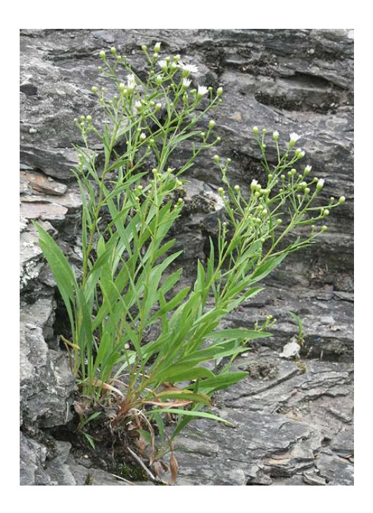
Upland White Aster in its favored open rocky ledge habitat.

State Status: Endangered Federal Status: None