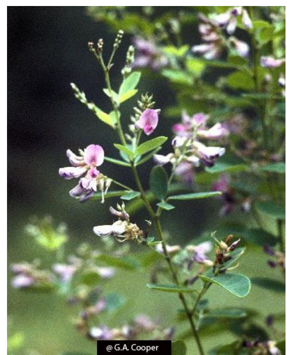
Large-bracted Tick-trefoil

State Status: Threatened Federal Status: None