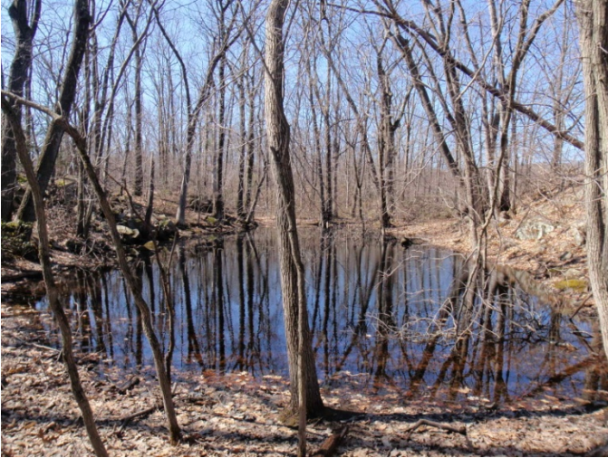
A classic saddle pool used for breeding by Jefferson Salamander.

exhibit a strong preference for pools with dark, tannic water as does Blue-spotted Salamander.