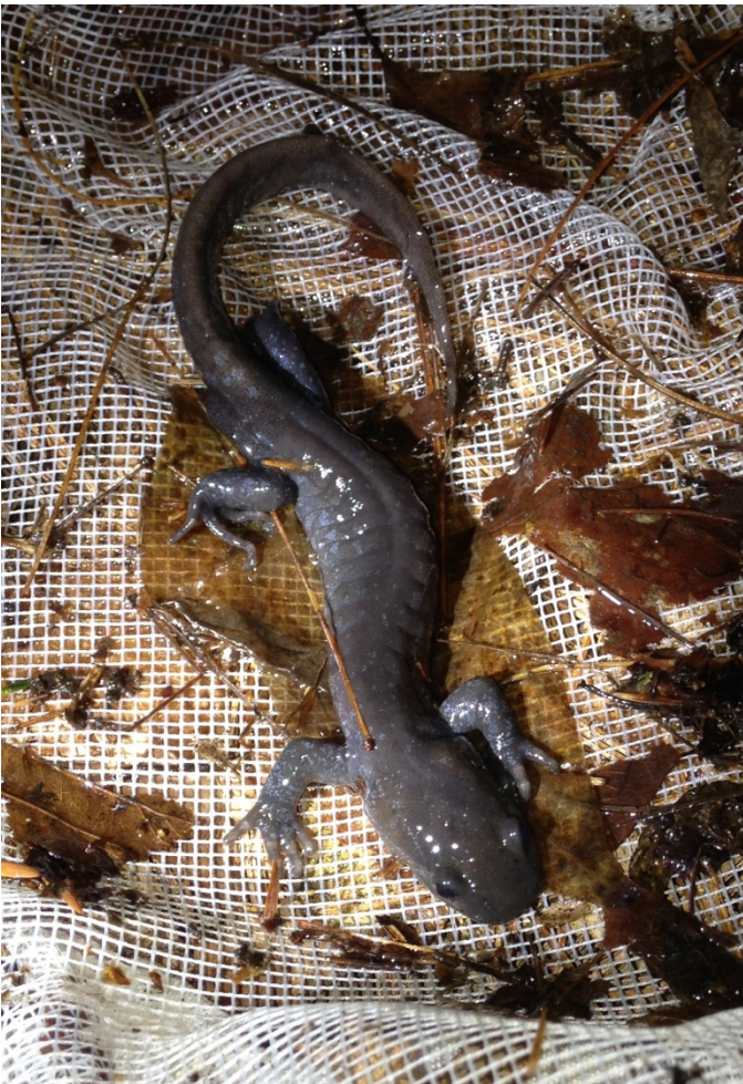
A male Jefferson Salamander captured from the bottom of a vernal pool in Sunderland, Massachusetts during the breeding season.

HABITAT: Adult and juvenile Jefferson Salamanders inhabit relatively mature deciduous and mixed deciduous-coniferous forests and woodlands. Circumneutral to calcareous sites at higher elevations seem to be preferred, with many known populations being associated with rich hillsides and ridges. Jefferson Salamander is somewhat selective with its breeding habitat in Massachusetts, as the species breeds almost exclusively in isolated vernal pools and shrub swamps. Abandoned agricultural ponds and other man-made impoundments are used in some situations, but Jefferson Salamanders tend to avoid other wetland types (e.g., red-maple swamps, floodplain marshes, beaver impoundments) used frequently by other mole salamander species. Vernal pools and shrub swamps nested between upland ridges (“saddle pools”) are used often. The most productive breeding pools appear to be those that are relatively large (0.2–0.5 acres), are deep (3–5 ft), and have patches of multi-stemmed shrubs (e.g., Cephalanthus occidentalis , Cornus spp.) Abundant detritus and absence of predatory fish are additional characteristics of typical breeding habitat. Water clarity seems unimportant, as Jefferson Salamander does not