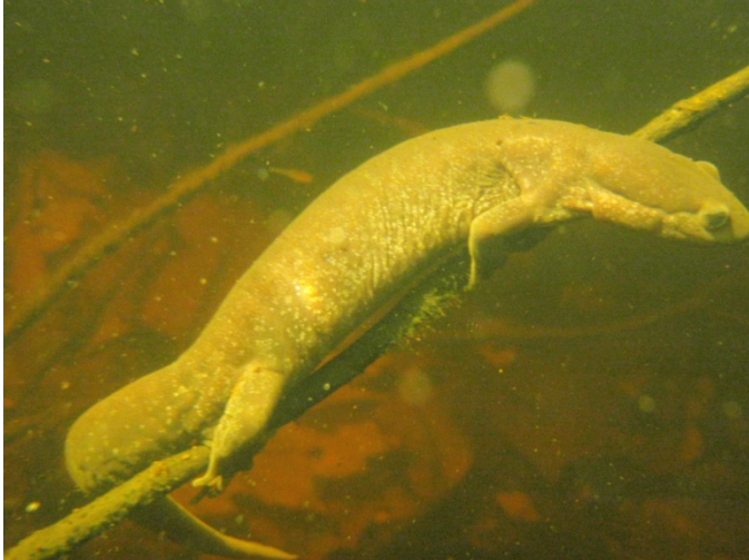
Jefferson Salamander ovipositing along a submerged twig.

polyploid ova, and the male's sperm merely activates embryonic development in the eggs without contributing any genetic material, thereby resulting in offspring that are essentially genetic clones of the unisexual mother. That unisexuals never produce offspring of the pure form is one reason why unisexual Ambystoma are believed to predominate in most local populations.