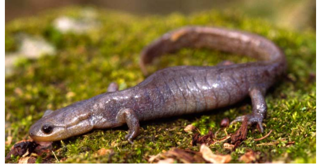
Jefferson Salamander

DESCRIPTION: Jefferson Salamander is a large, gray to brownish-gray salamander with fine markings of light blue to silvery flecks on the limbs, lower sides, and tail. Adults measure 4–7 inches (10–18 cm) in total length. The tail is laterally compressed (especially in sexually active males) and is approximately the length of the body. Jefferson Salamander is in the family of mole salamanders, and so it has distinctively long toes and a stockier build relative to other groups of salamanders in our region. Males tend to be smaller than females and have conspicuously swollen vents during the breeding season.