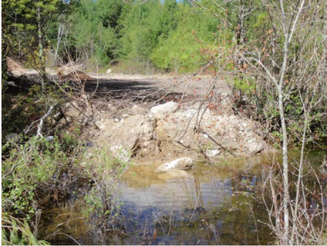
Illegal clearing of forest and filling of vernal pools is an ongoing threat to pool-breeding salamanders in Massachusetts.

draining) of vernal pools during residential, commercial, industrial, mining, or agricultural development.