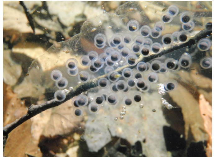
Jefferson Salamander egg mass attached to a submerged twig.

Hatching occurs in 3–4 weeks, whereupon the bushy-gilled, fully-aquatic larvae spend the next 2–3 months in the wetland. The salamander larvae feed voraciously on zooplankton, insect larvae (e.g., mosquitoes), and other aquatic organisms, increasing in body size and developing front and hind limbs as spring advances into summer. Metamorphosis then occurs in July or August, depending on when the wetland begins to dry, when food resources become limited, or on other factors. At this time, the larvae develop lungs, resorb their gills, and seek cover beneath stones, woody debris, leaf litter, or other detritus in moist or saturated portions of the