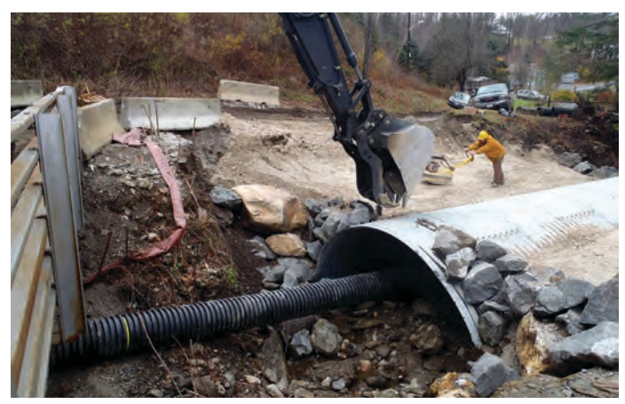
Contractors installing a wildlife-friendly culvert on Thunder Brook in Cheshire