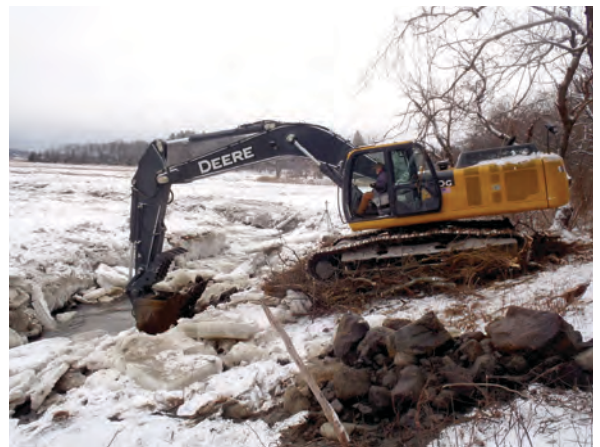
Town Creek Restoration, Salisbury Amethyst Brook Restoration Celebration Event, Pelham