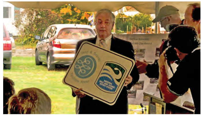
Congressman Barney Frank accepting Taunton River — Wild and Scenic River Award.

DER continues to be a leader in promoting better designed culverts for fish and wildlife passage. In 2012 DER provided multiple volunteer and professional trainings (see inset map) leading to over 1,000 road crossings surveyed. DER continues to coordinate the state River Continuity Partnership Meeting and organized three Stream Crossing Design: Flood Resilient, Fish Friendly Workshops.