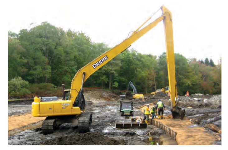
... rebuilding a stream channel through the former impoundment.