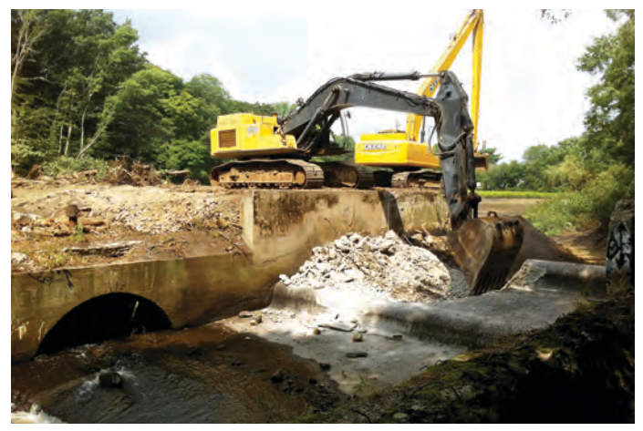
Machines begin to remove the Hopewell Mills Dam in Taunton, and then...

The River Restoration Program hit its stride in 2012 by removing nine dams and replacing one culvert — a record for the program and second in the nation! These projects are all multi-purpose including elements such as floodplain restoration; removal of contaminated sediment; installation of bird perches; reuse of historic objects for interpretation; or community trail development. Next year, DER and partners plan to remove 6 to 8 dams, opening over 50 river miles. The pictures below from Taunton , Pelham and Cheshire illustrate some of our work over the last year.