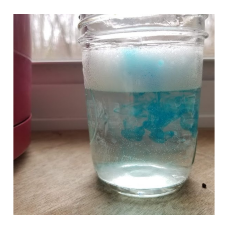
Shaving cream cloud