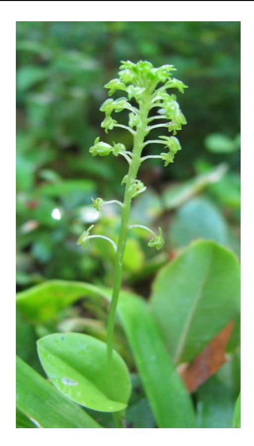
Bayard's Adder's-mouth.

State Status: Endangered Federal Status: None