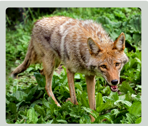
NOTE FOR PET OWNERS: Coyote mating and denning season is January through May. This can increase coyote aggression toward dogs. If you think you are close to a coyote den, keep dogs on a leash, pick up small pets, and leave the area calmly. Do not run.

The intent is to frighten, not injure, the animal. Hazing is most effective when it's done repeatedly, when a variety of techniques are used, and when many people in the area participate. Hazing is not effective if done from inside a building, from behind a screen door, or from a car.