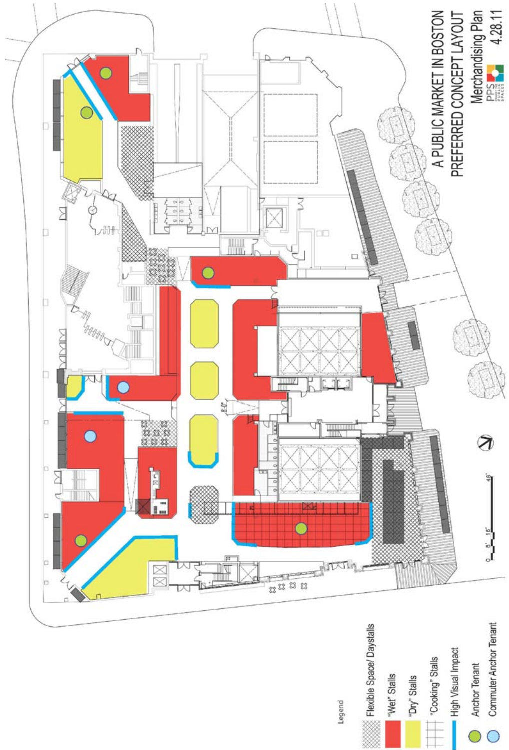
Figure 2: Merchandising Diagram (Resource Portfolio L)